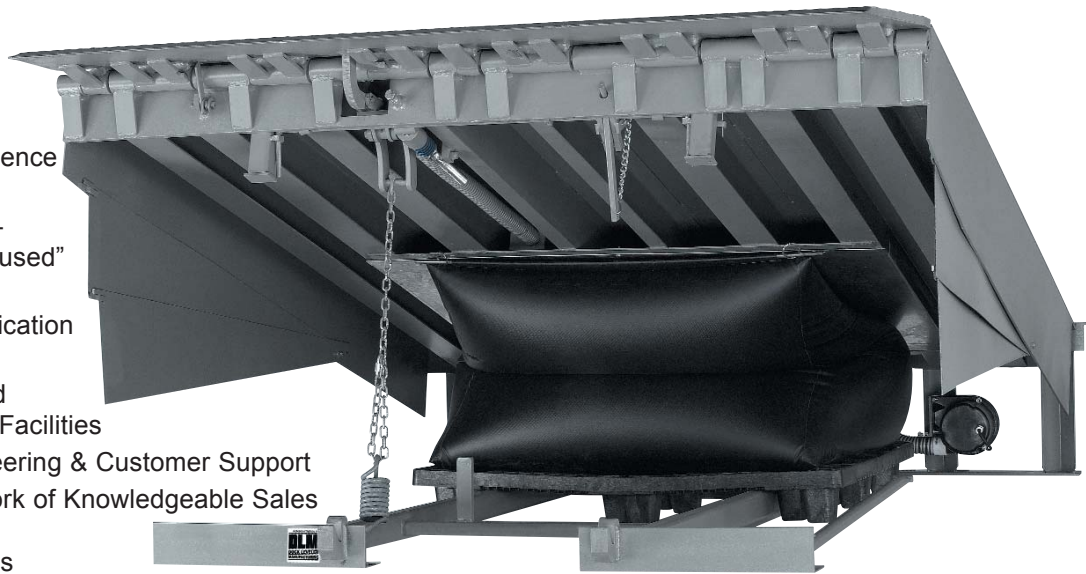
DA Series, 7' x 10', 50,000 CIR, Full Range Toe Guards, CleanSweep Frame™

Since introducing the “freight industry’s” first Edge-of-Dock leveler in 1962, DLM has continued to provide innovative ways to improve productivity and safety at the loading dock. The “DA” Series Leveler combines the “push-button” convenience of hydraulic levelers with the economics of a mechanical leveler to bring value and performance to your loading dock. From superior structural design to unlimited operator features, the “DA” Series air powered leveler is a wise investment.