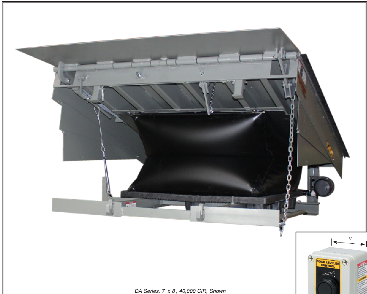
DA Series, 7' x 8', 40,000 CIR, Shown