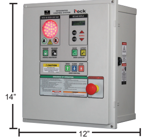
Integrated Control Panel Shown (Standard Size)

INSTALLATION: Requires mounting of locking unit, control panel, exterior lights and signs in strict accordance with DLM installation instructions. UniLock can be welded to an optional new construction embed plate or by installing 15 anchor bolts (included) plus 16" of weld to dock curb steel. Mechanical installation is recommended to be performed only by authorized DLM Representative.